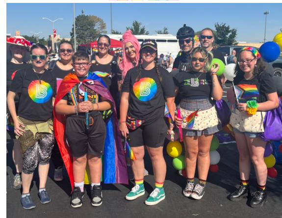
BBBS staff, mentees, and mentors at Albuquerque Pride 2022